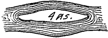
A A Shickshinning